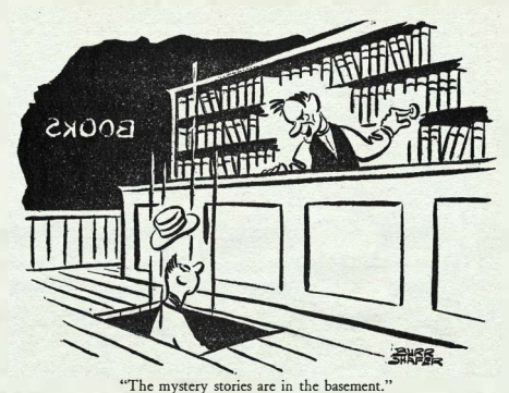
by permission of The Saturday Review of Literature